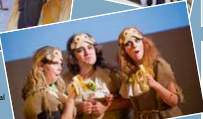
Photos from the 2015 Skye Festival

SEALL is the UK's liveliest rural community promoting organisation in the UK.